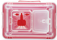
Regular funnel clear top hinge cap with petals