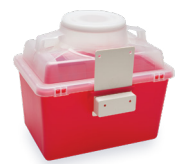
305456 with 305485 bracket