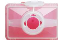
Open clear top with tethered cap