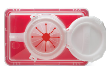
Large funnel clear top hinge cap with petals