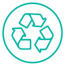
Contains recycled content