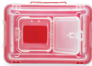
Open clear top hinge cap