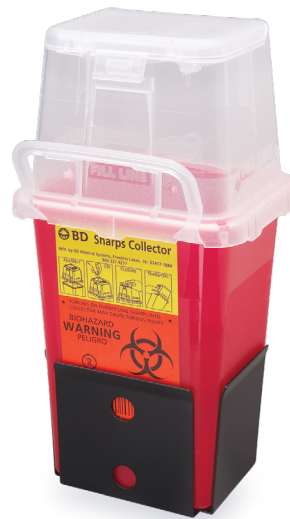
305487 with 305970 bracket